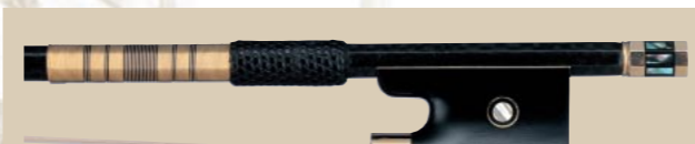
CBB107ZB Artist Signature Series