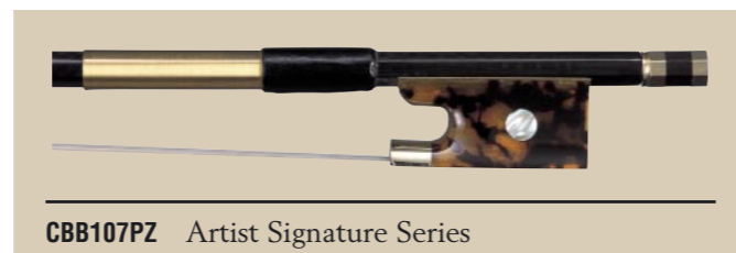
CBB107PZ Artist Signature Series

Internationally renowned violin and viola soloist, chamber musician, and teacher Pinchas Zukerman worked together with Yamaha designers to produce a bow for professional violinists, as well as for serious students preparing for a career in music. His tremendous talent and experience coupled with close attention to the most intricate details guided the design of Zukerman's bow.