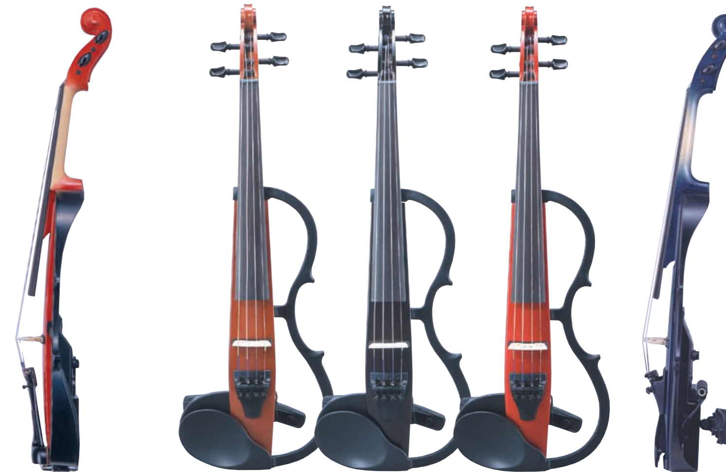
Cardinal Red Brown Black Candy Apple Red Black