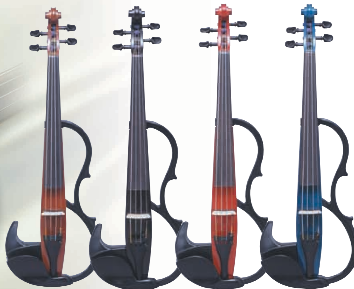
Brown Black Cardinal Red Ocean Blue