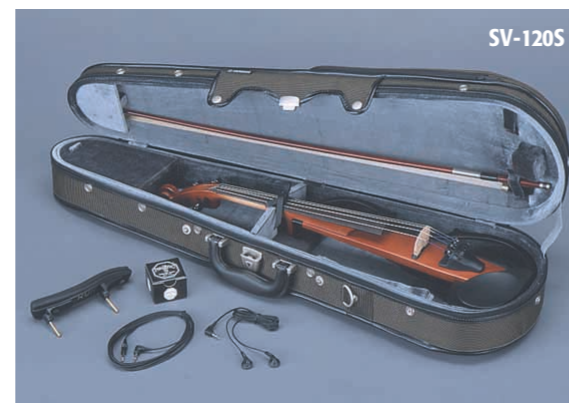
The SV-120S supplies nearly everything you need to get started.

The SV-200 joins our Silent Violin family along with the new SV-120 Silent Violin. An instrument that has undergone some refinements for greater sound and playability.