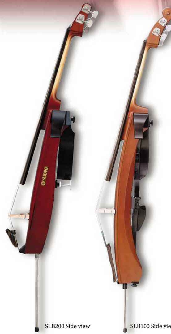
SLB200 Side view

Michael Brecker Quartet, Mike Stern Band, and his own band