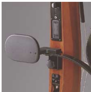
Knee Support BKS1 for SLB100 (Optional)