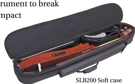
SLB200 Soft case

Both the SLB100 and SLB200 feature detachable frames that provide excellent support and comfort when playing the instrument. Frames remove easily to increase the portability of the instrument. The SLB200 is designed so as to allow the entire instrument to break down and fit into a compact case which can be carried comfortably with the shoulder strap.