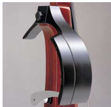
Extension Frame BEF2 for SLB200 (Optional)

A knee support and extension frame are optionally available for the SLB200 to provide greater comfort and support while playing the instrument. A knee support is also available for the SLB100.