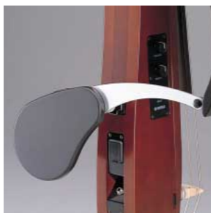
Knee Support BKS2 for SLB200 (Optional)