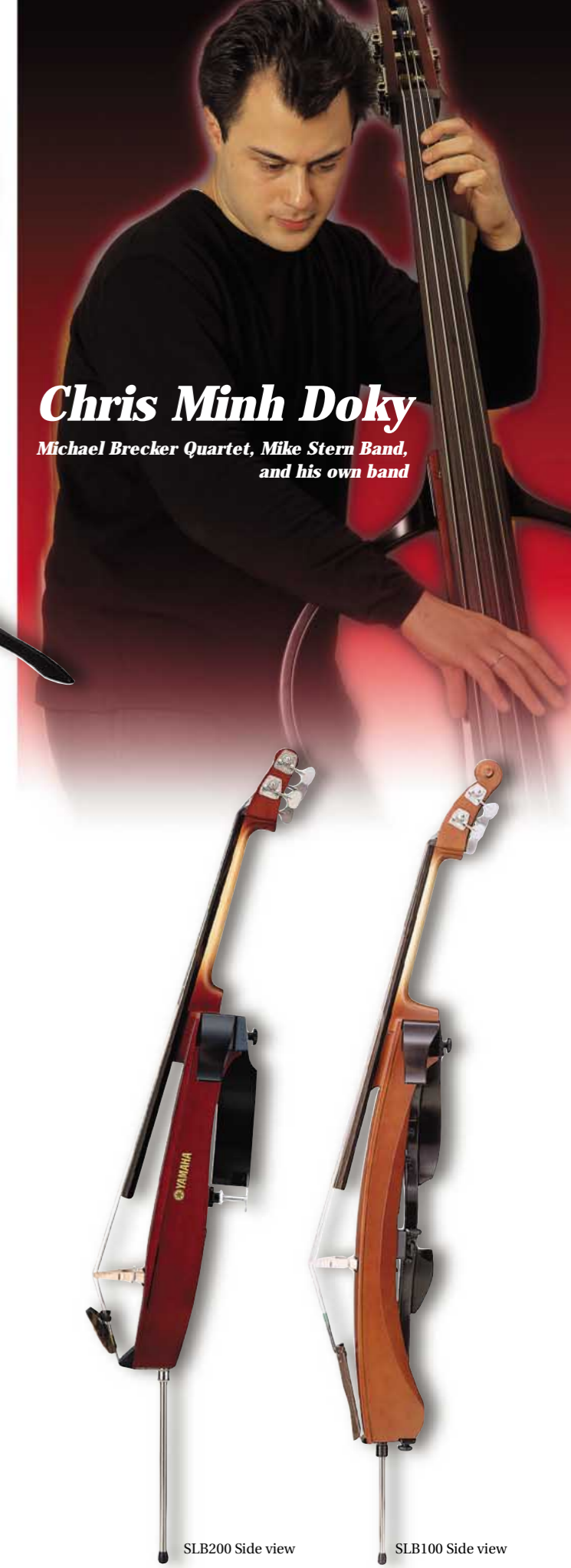
Chris Minh Doky

Michael Brecker Quartet, Mike Stern Band, and his own band